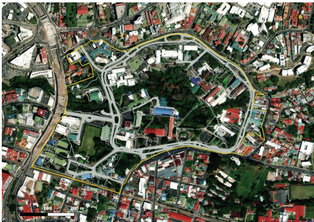
Fig. 1. Campus of the University of Costa Rica (only Finca 1 is shown) and the surrounding urban area of Montes de Oca, San José. The yellow line delineates the sampled area. Within this polygon, gray stripes represent roads, and white lines delineate trails, sidewalks, and parking lots.

The flora of the campus is diverse, with a variety of native versus introduced and wild versus planted trees, shrubs, and herbaceous plants, which are intensively managed. This flora provides a variety of nesting and foraging